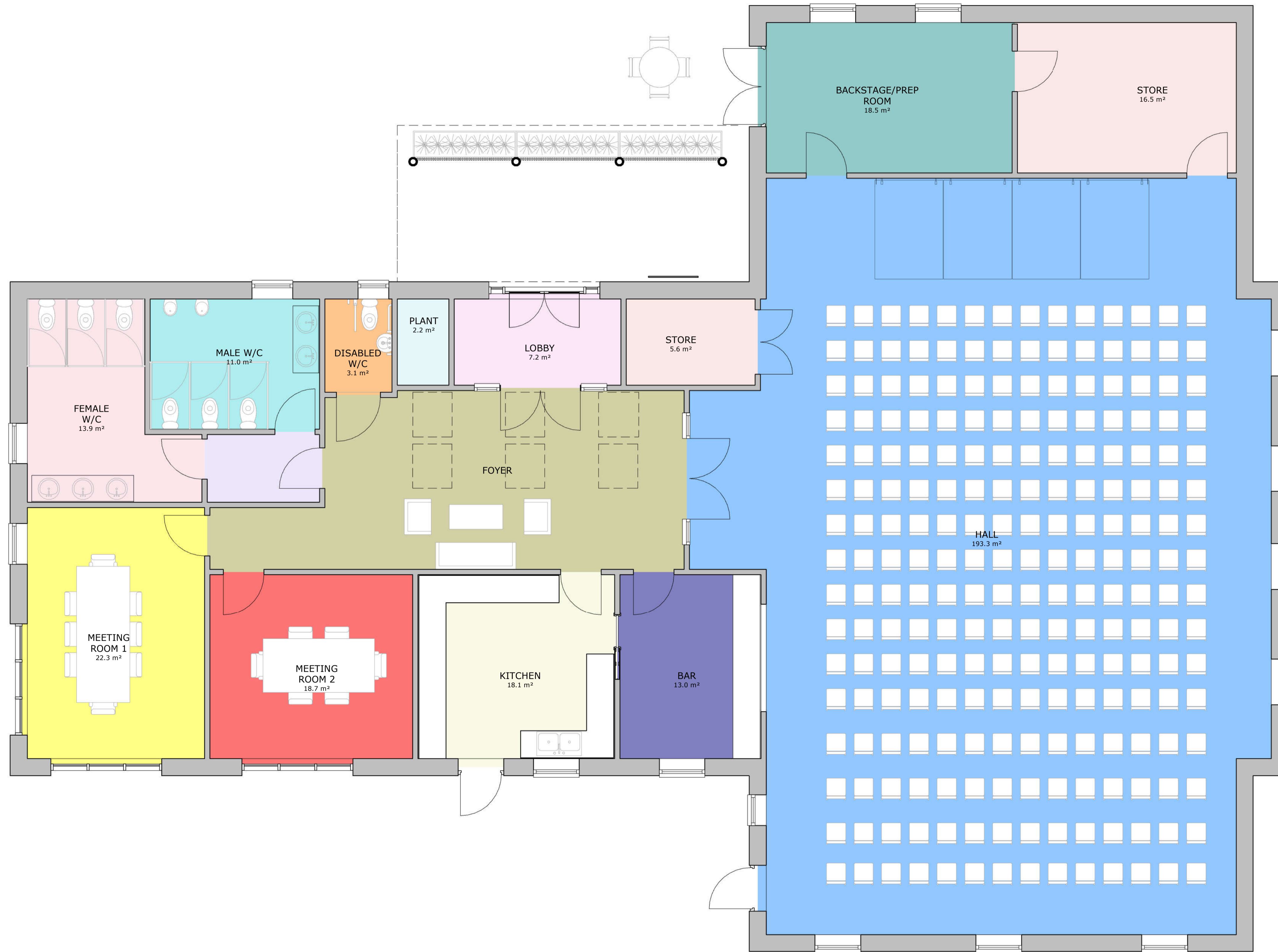
1 Proposed Floor Plan 1:50